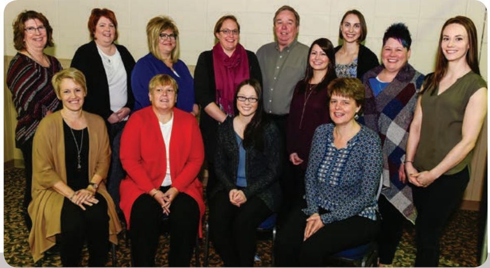
Alzheimer Society of Saskatchewan staff members who attended Summit, including many of the First Link® Coordinators from across the province.