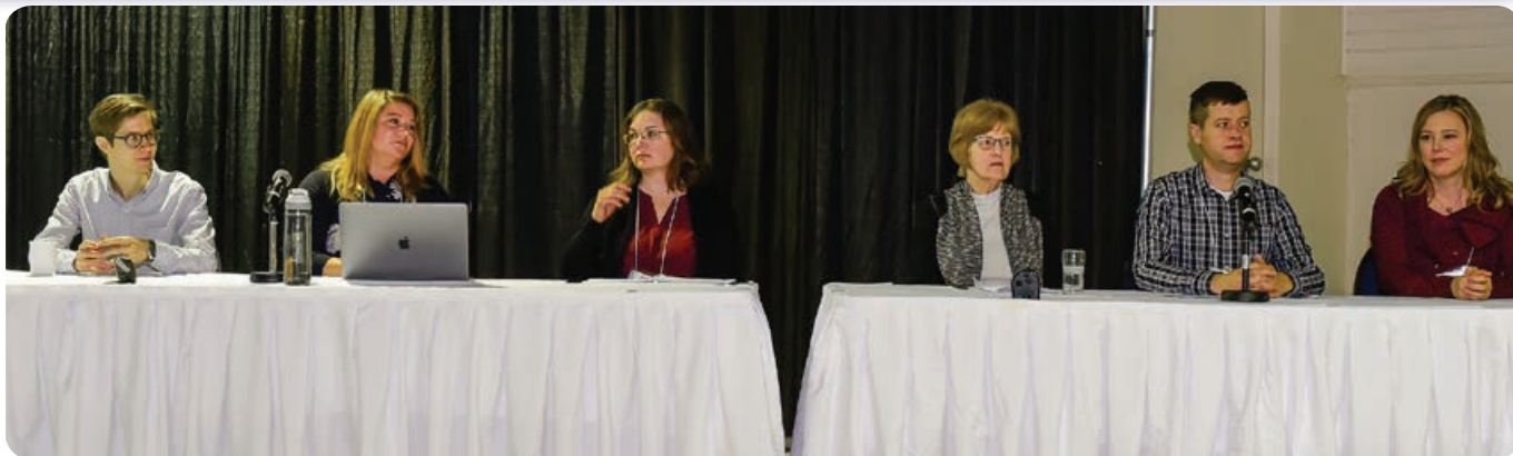
Members of the RaDAR team prepare for research highlight presentations and panel discussion.