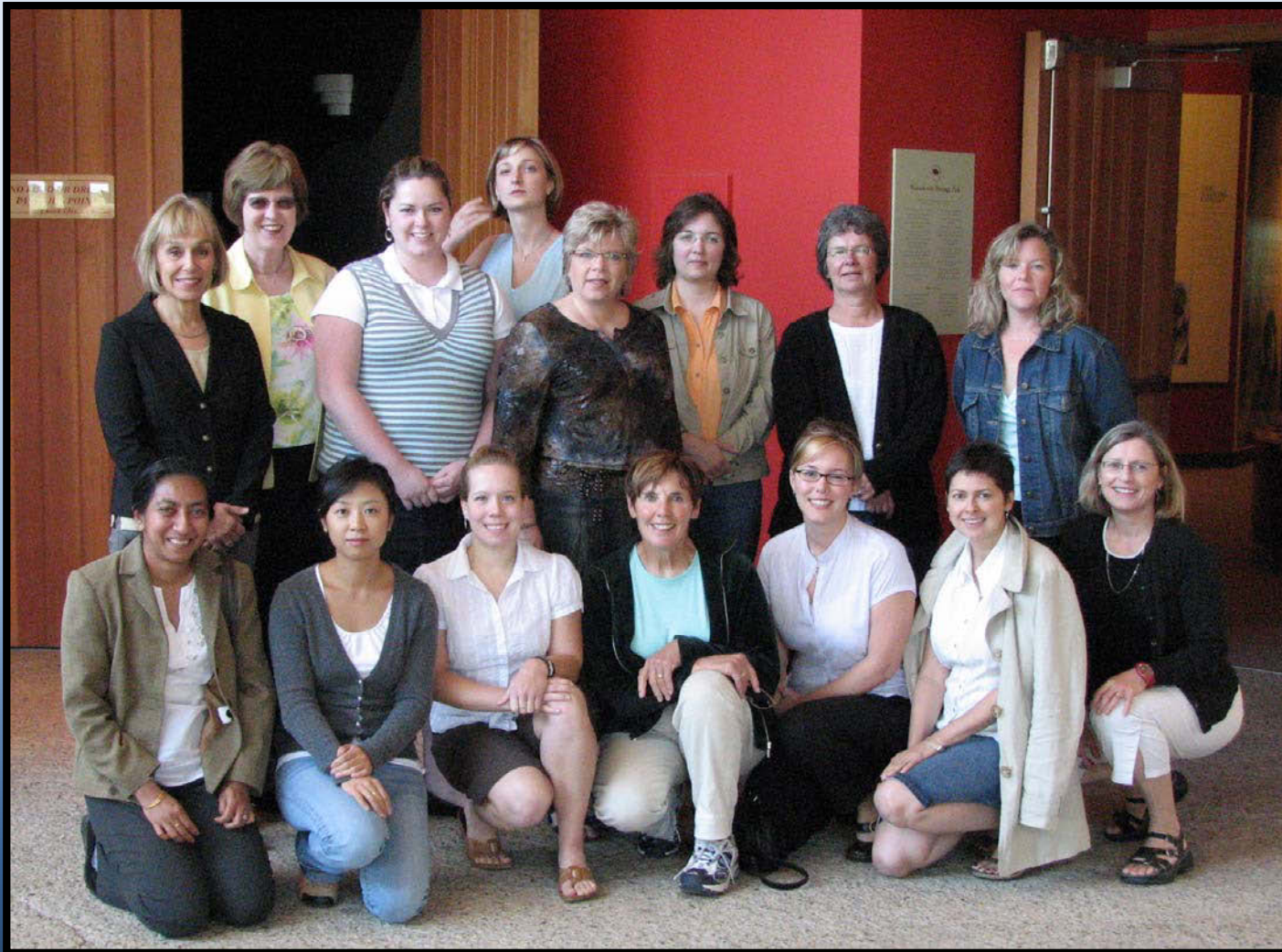
NET Retreat 2007 Wanuskewin