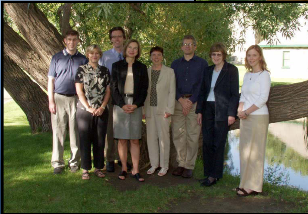
NET Team members - Summer