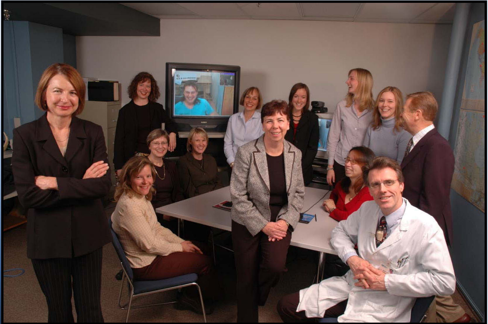
The NET research team and RRMC staff