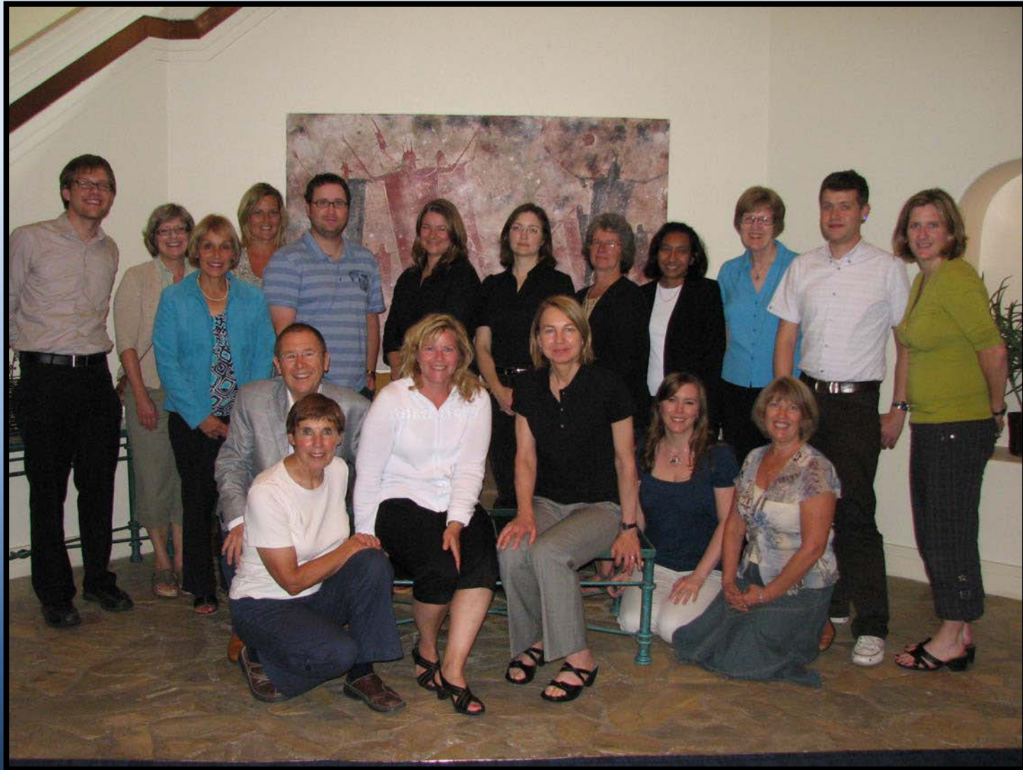
NET Retreat 2009 The Willows