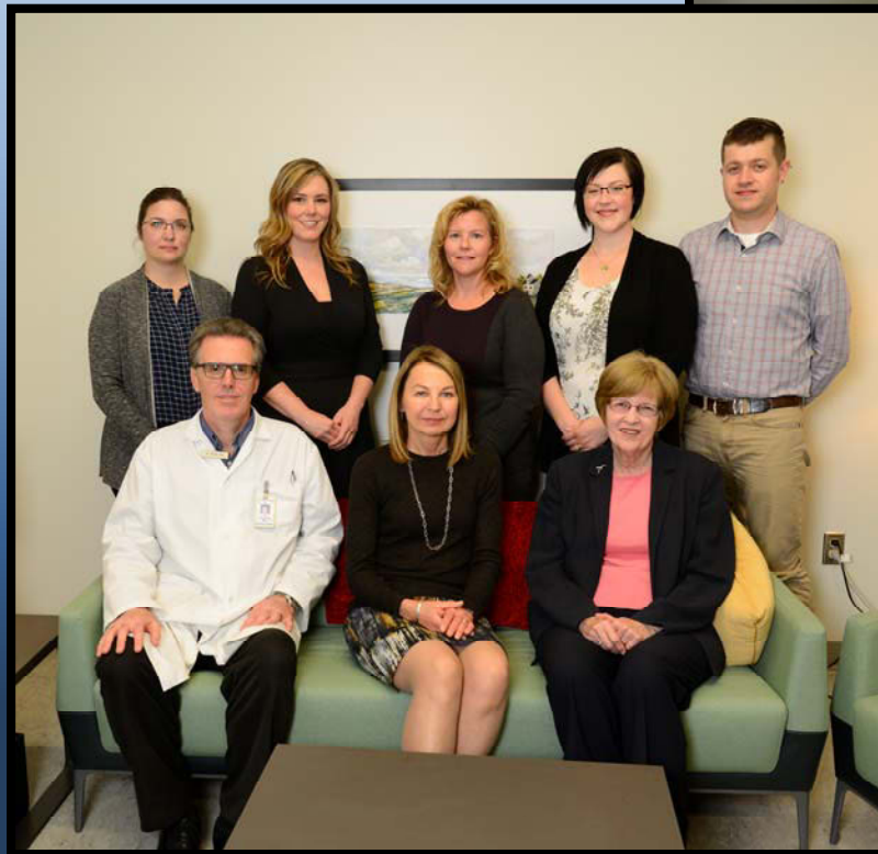
RRMC team in new RRMC location