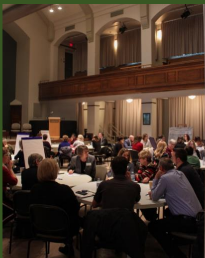
World Café discussion