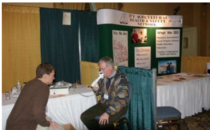
Lung function testing at the Summit

The Saskatchewan Farm Injury Control Summit VIII Taking Care of the Farmer was organized by the Network with sponsorship from Saskatchewan Agriculture and Food, the Canadian Agriculture Safety Association, Agriculture and Agri-Food Canada, and the College of Agriculture's Cyril Capling Trust fund for the benefit of delegates from community agencies and organizations, health districts, individual farm families, RM councilors and provincial government employees who work in agriculture.