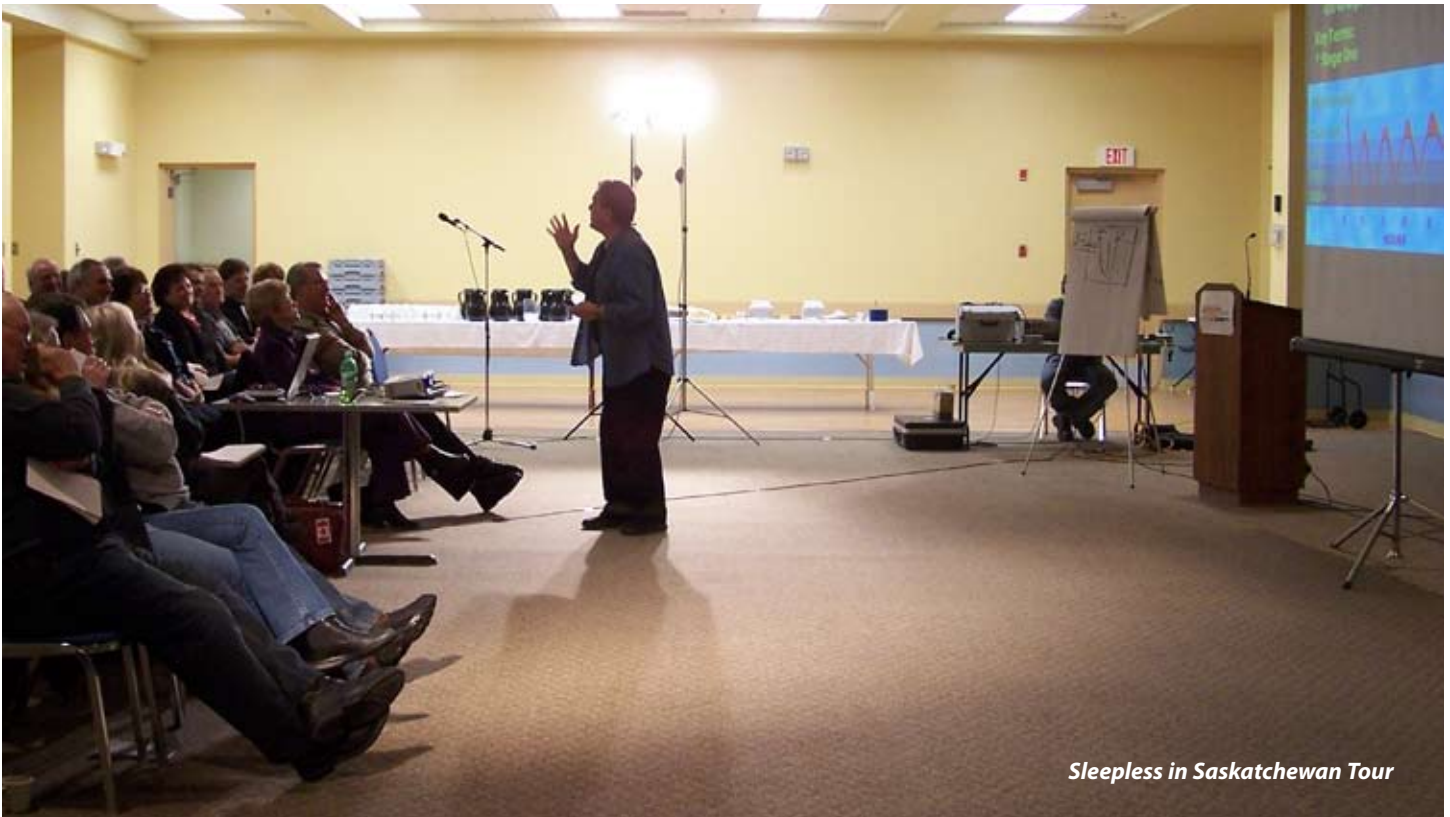
Sleepless in Saskatchewan Tour