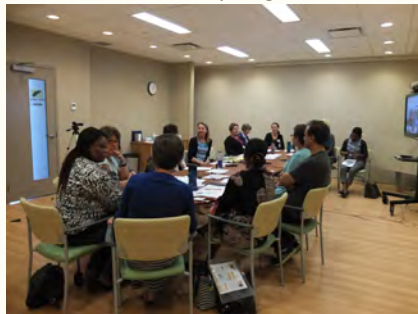
Kipling PHC Team and RaDAR

RaDAR continues to work with the Kipling PHC team to adapt and evaluate best practices in dementia care (e.g., standard tools and protocols, multidisciplinary team care, education/support from specialists and others).