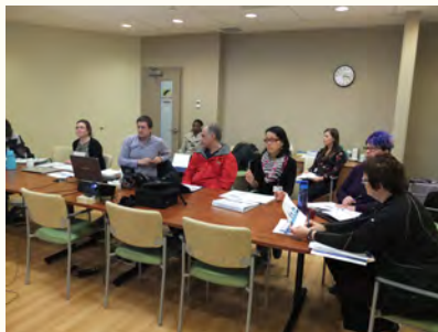
PC-DATA session with Kipling PHC Team

In terms of standard tools and protocols, test versions of visit flow sheets for patients with possible dementia have been added to the EMR system.