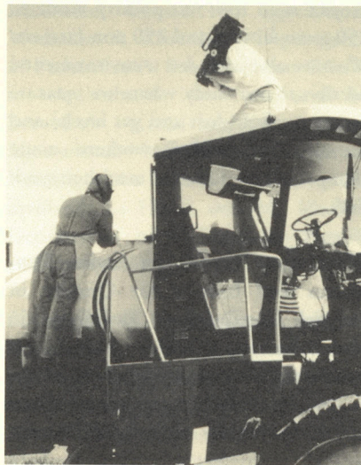
"Breathe Easy" video filming.

Respiratory Video "Breathe Easy": A 20-minute video highlighting agricultural respiratory hazards and control measures to reduce risk was produced in conjunction with the University of Saskatchewan's Department of Audiovisual Services. The video will be used in the seminar component of the Respiratory Health Maintenance Program. Copies of the video are available at a cost of $5 to Network members and $10 to non-members. Funding from the Canadian Agricultural Safety Program (CASP) supported the development of the video.