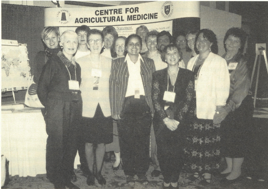
Faculty, staff, students and volunteers at the Fourth International Symposium: "Rural Health and Safety in a Changing World", October 18-22, 1998 at the Delta Bessborough Hotel, Saskatoon, SK.