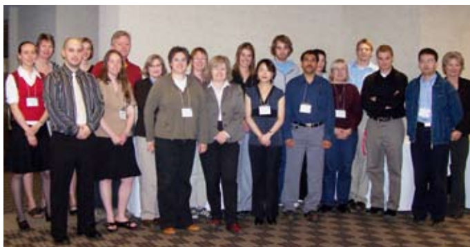
PHARE students at the Midterm Planning Session in Saskatoon